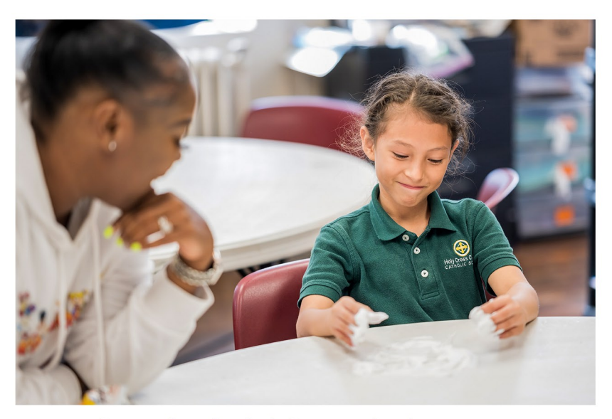
Creative play at Brookside Community Development Center's Youth Development Program

Together, we can truly make a significant impact. We can demonstrate what REALTORS® and the real estate industry are really about: helping people find a place to call home. The REALTOR® Foundation has the plan, the knowledge, and the energy to make a difference. So get ready for a remarkable evening of celebration in support of an amazing cause. Learn more about who & how we serve in your community at realtorfoundation.org.