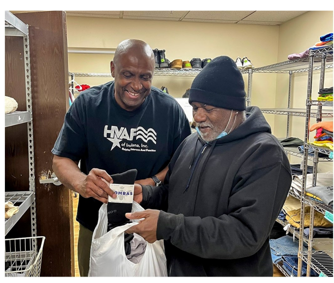
Getting supplies for winter at HVAF's Pantry (Helping Veterans And Families)